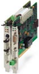
Termination board - system coupler with copper connection

Please be informed that the data shown in this PDF Document is generated from our Online Catalog. Please find the complete data in the user's documentation. Our General Terms of Use for Downloads are valid ( http://phoenixcontact.com/download )